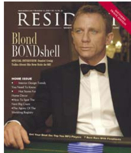
New York Resident